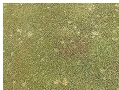
Close up of Practice Green without SeaBlend

Please call your Ocean Organics distributor for further information, or call us directly at 800 628-GROW (4769).