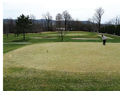
Practice Green without SeaBlend Note: The two greens are 120 feet apart. Putting in foreground, #2 in background.