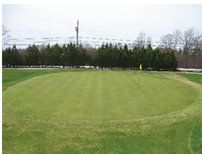
Hole #2 after using SeaBlend

Al Choiniere, Champlain Country Club, Swanton, VT